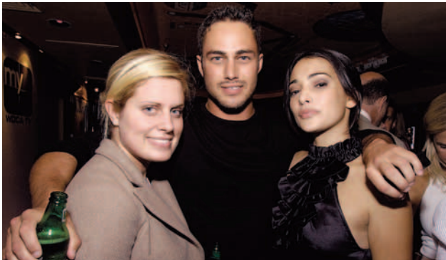
Fashion House stars Taylor Kinney and Natalie Martinez (right) greet a guest